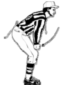
Illegal Use Of Flatulence (Pull my finger)