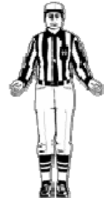
I Have No Idea What's Going On (Leftover signal used by replacement refs)