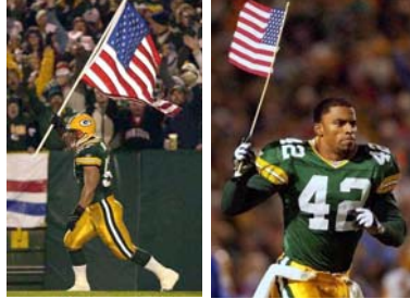
Green Bay and the Packers Honor our recently fallen Americans