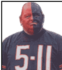
Die-hard Chicago fan (circa 2004) just wants to give Rex Grossman a big ol' Bear-hug.