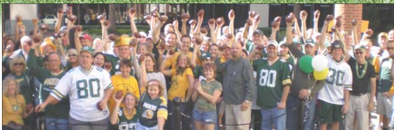
Here's a nice picture from last season of some of our good-looking Central Florida Packer Backer family showing the rest of the league that they have balls! So, do you have the cojones... and $20 -bucks? Providing you're not Virginia Halas McCaskey, we'd love to have you join us!

This just in: The economy is so bad, that instead of a coin-toss this season, all NFL games will begin with flipping a quarterback.