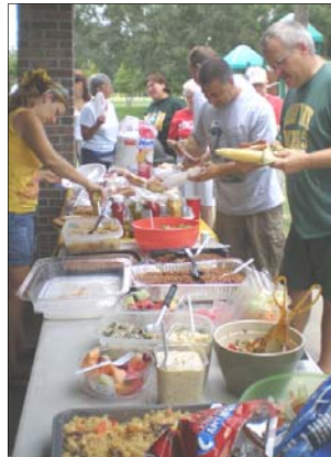
Brats, potato salad and corn, oh my! If you're a Packer fan, come load-up on lots of free food at the annual "Packer Picnic" on Sunday, July 26, 2009 at Barnett Park!

Throwing toilet seats and kicking the stuffing out of a Bear, now that's how you spend a Sunday afternoon!